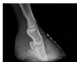
X-ray of horses foot with severe