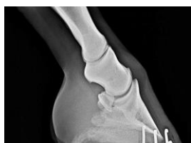
X-ray of normal horses foot

Laminitis is an extremely painful inflammatory condition of the delicate laminae in the hoof. In healthy hooves these delicate (Velcro-like) tissues bind together the inner hoof wall and the pedal bone. Laminitis affects the blood flow to these tissues causing them to weaken. As laminitis develops the attachment of the pedal bone to the hoof wall starts to fail, leaving the pedal bone to rotate and point towards the sole, and in the worst cases to sink right through it. Laminitis is most common in the front feet but can affect all four.